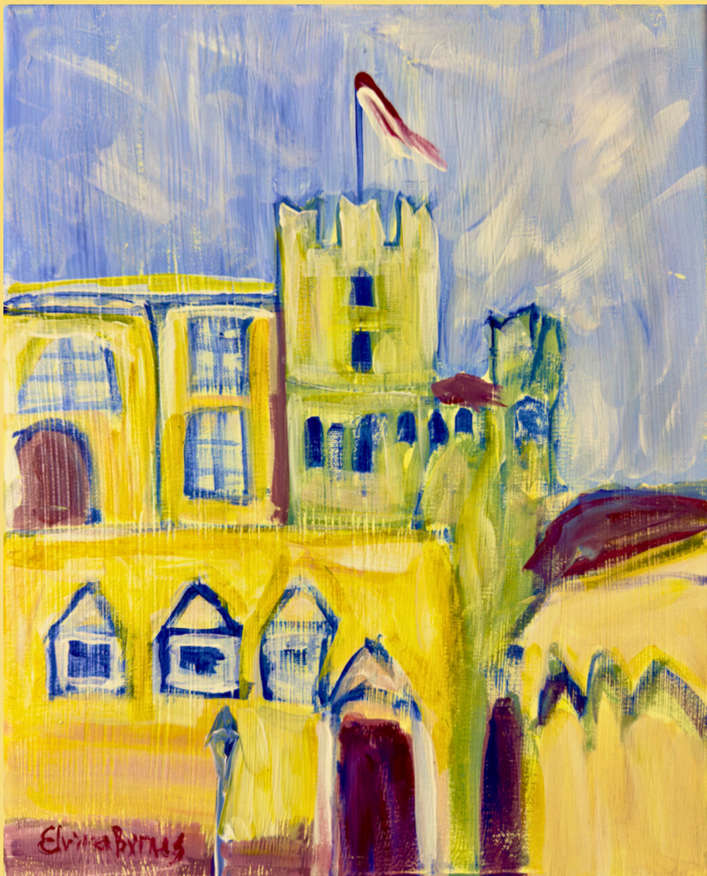
“Château Ensoleillé”, 41x43cm, acrylic on canvas