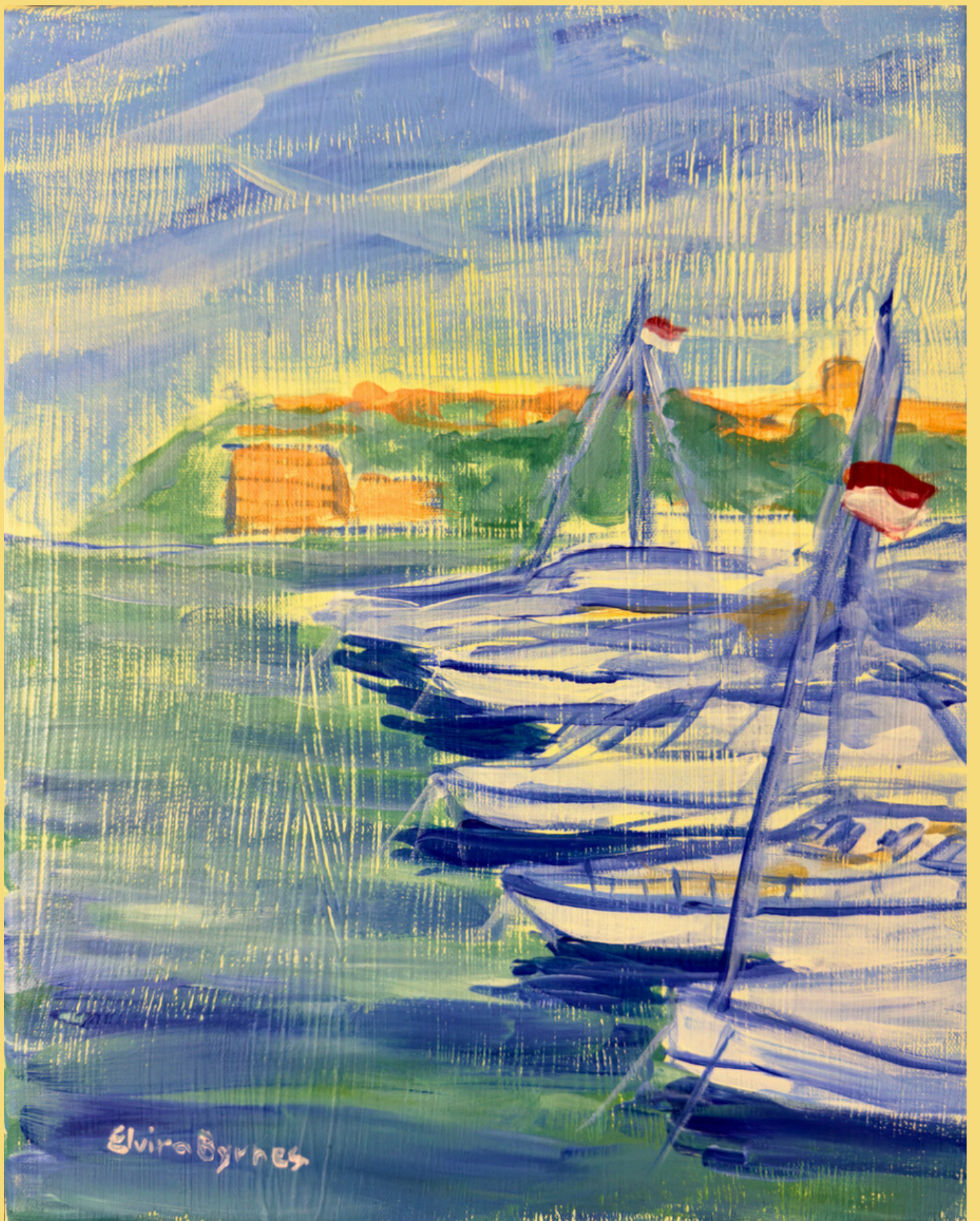
“Port Hercules”, 41x43cm, acrylic on canvas