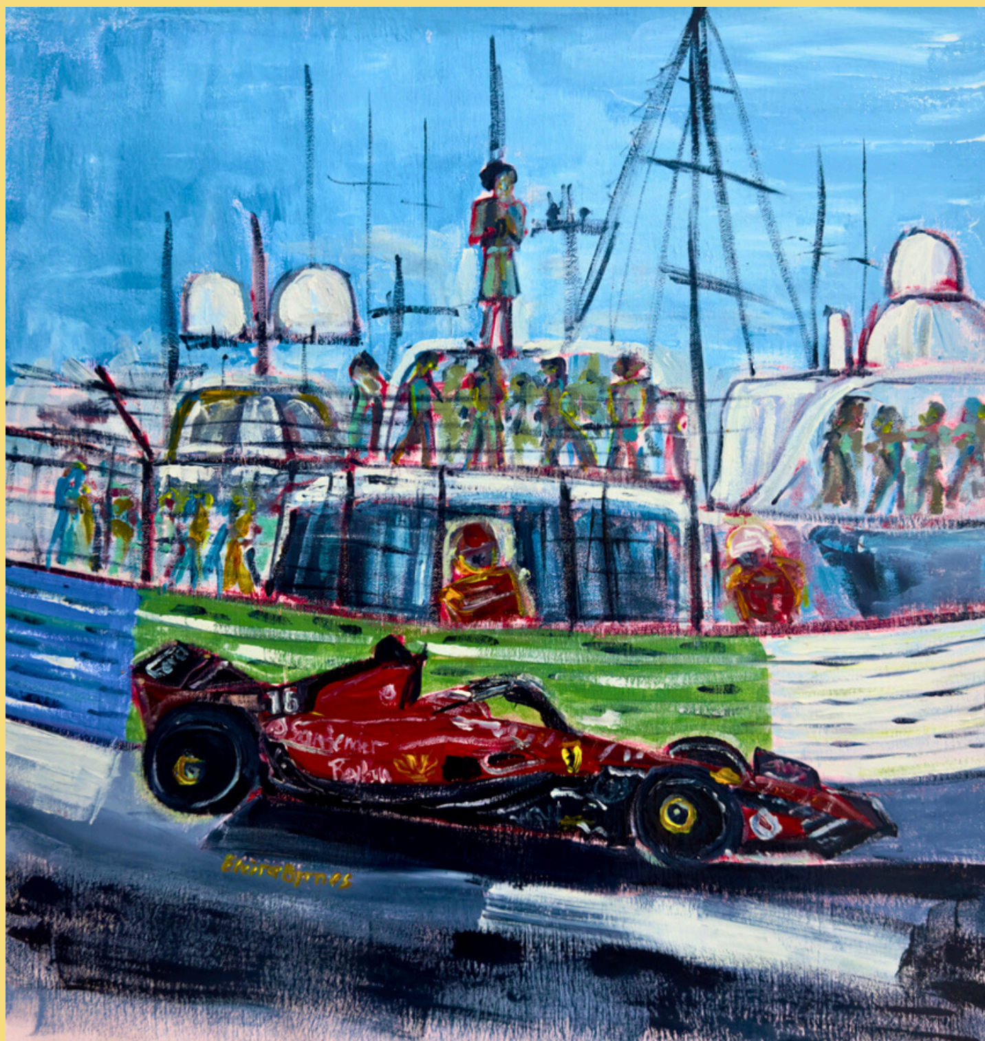
“Airborne”, 56x59cm, acrylic on canvas