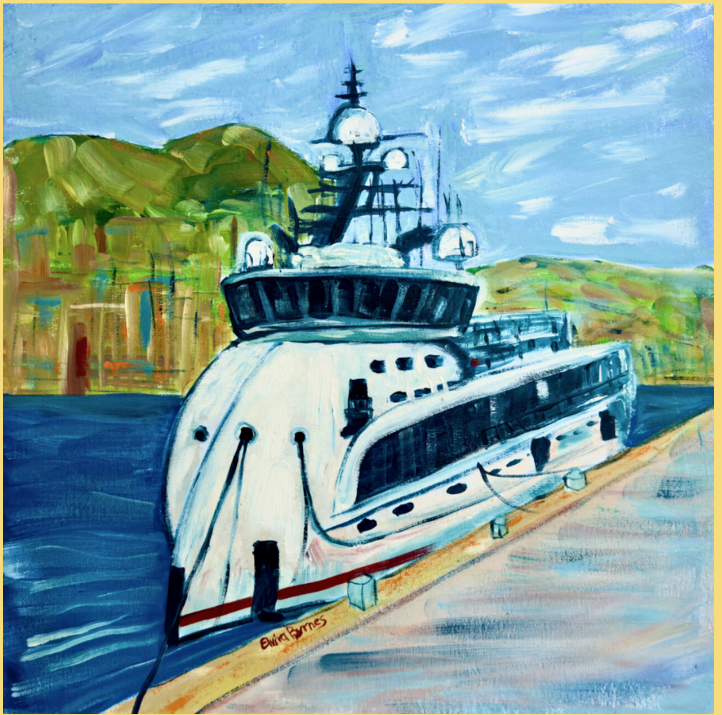
“Olivia O”, 56x59cm, acrylic on canvas