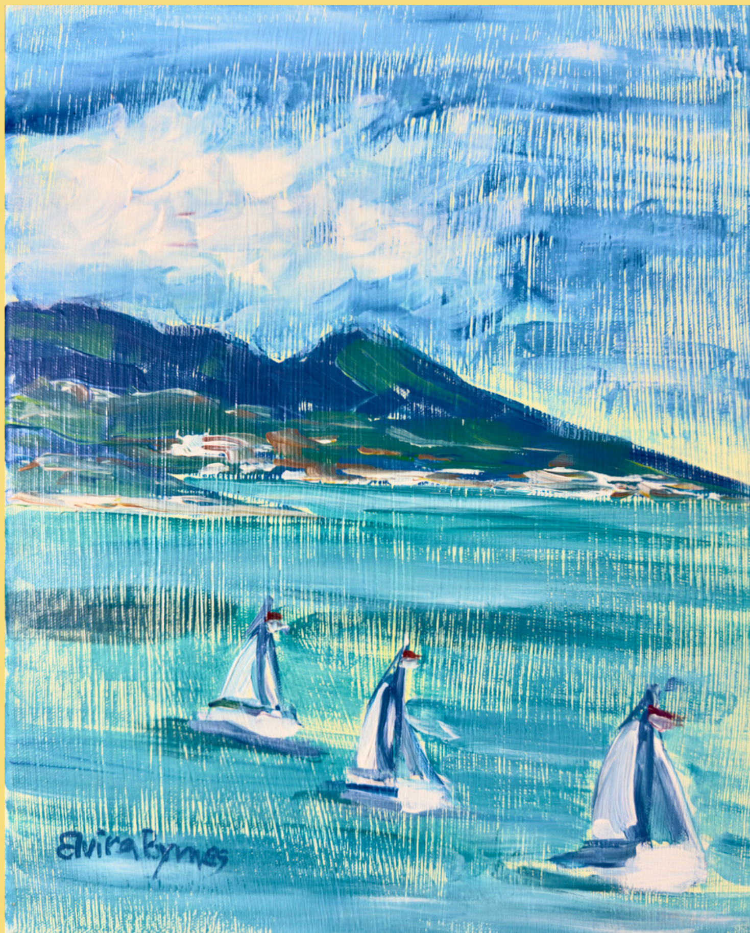
“View from Jardins Saint-Martin”, 41x43cm, acrylic on canvas