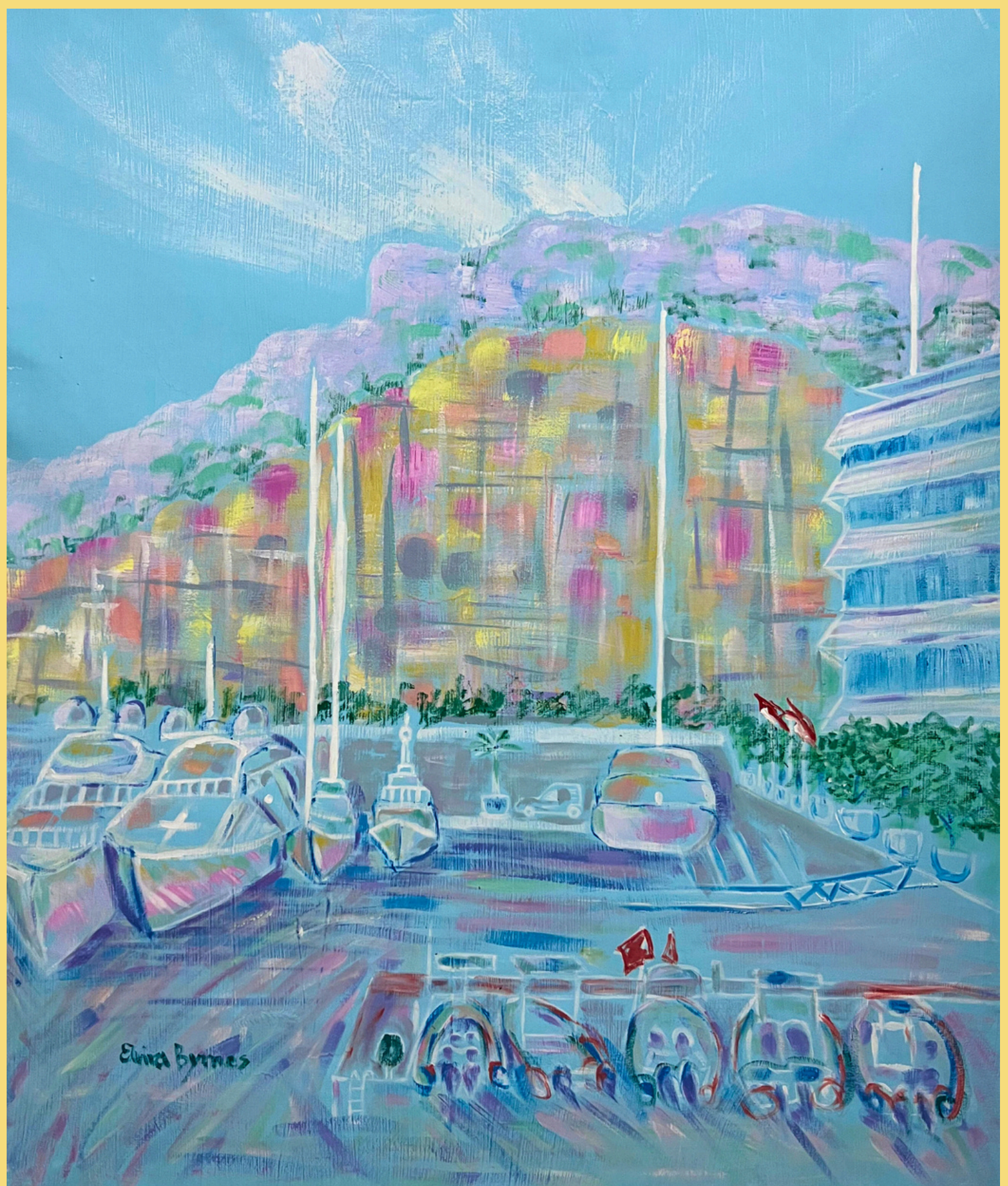
“Good Morning, Monaco! (Dawn)”, 127x90cm, acrylic on canvas