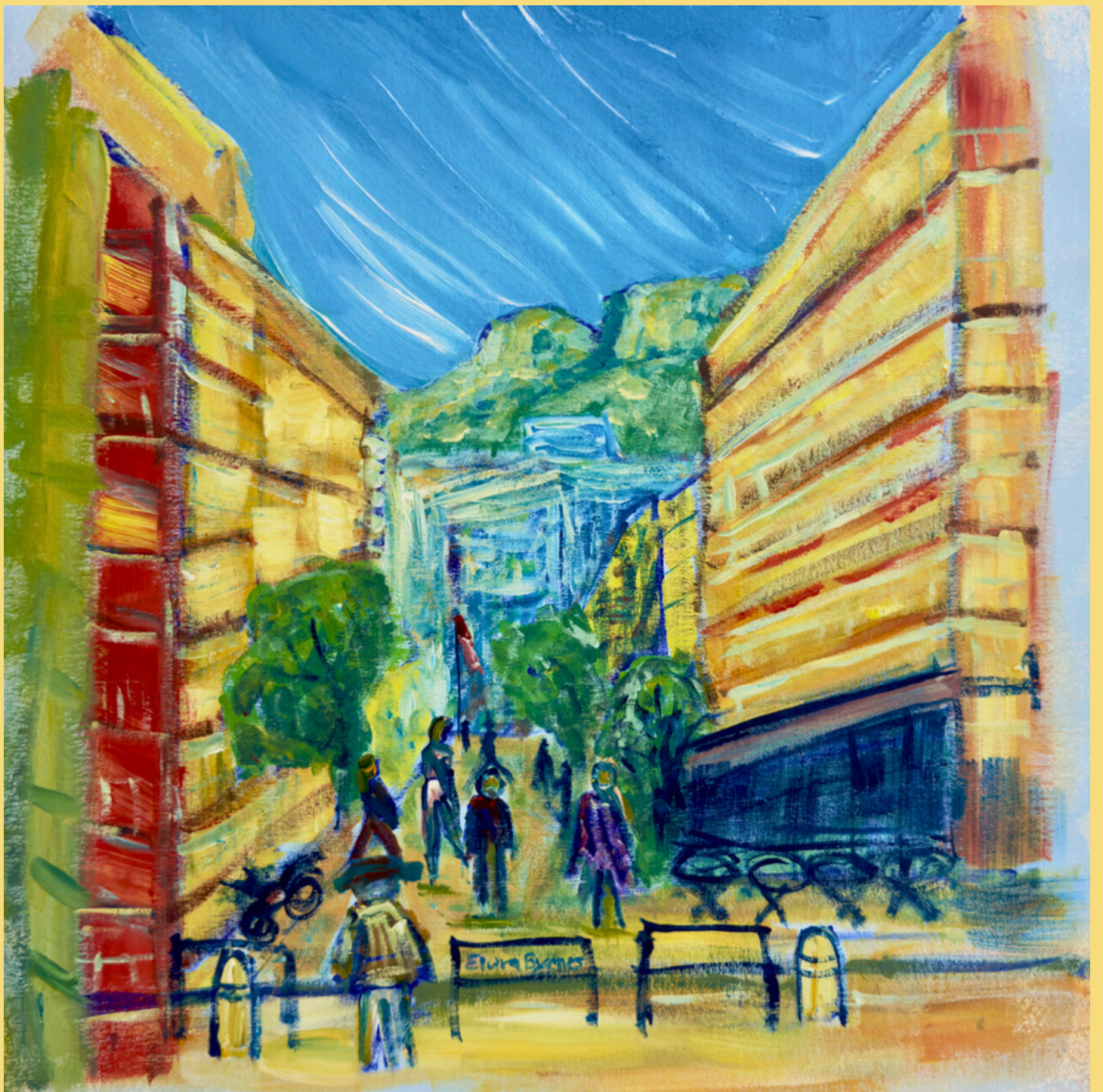
“Rue Princesse Caroline”, 56x59cm, acrylic on canvas