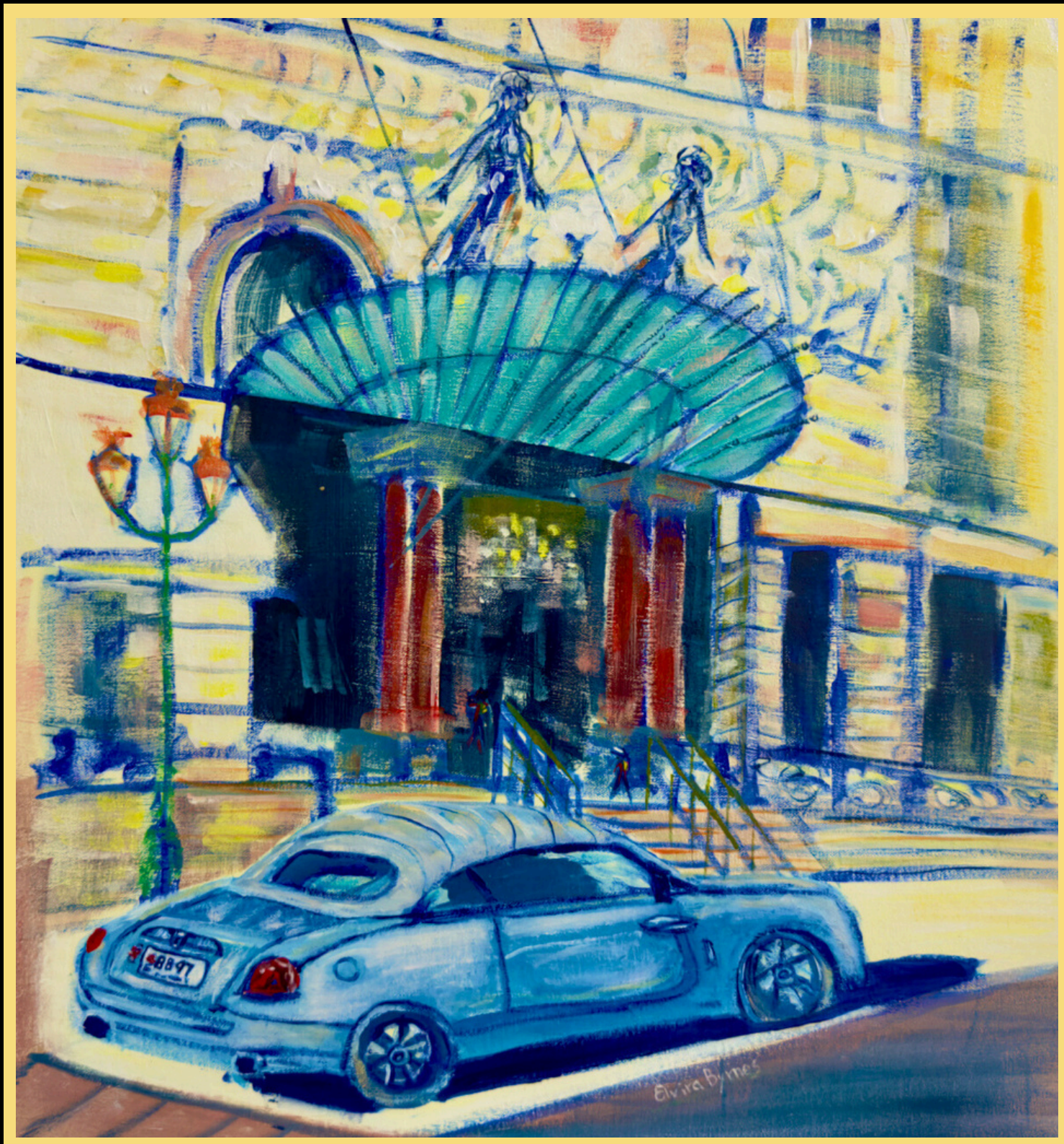
“Hotel de Paris”, 190x127cm, acrylic on canvas