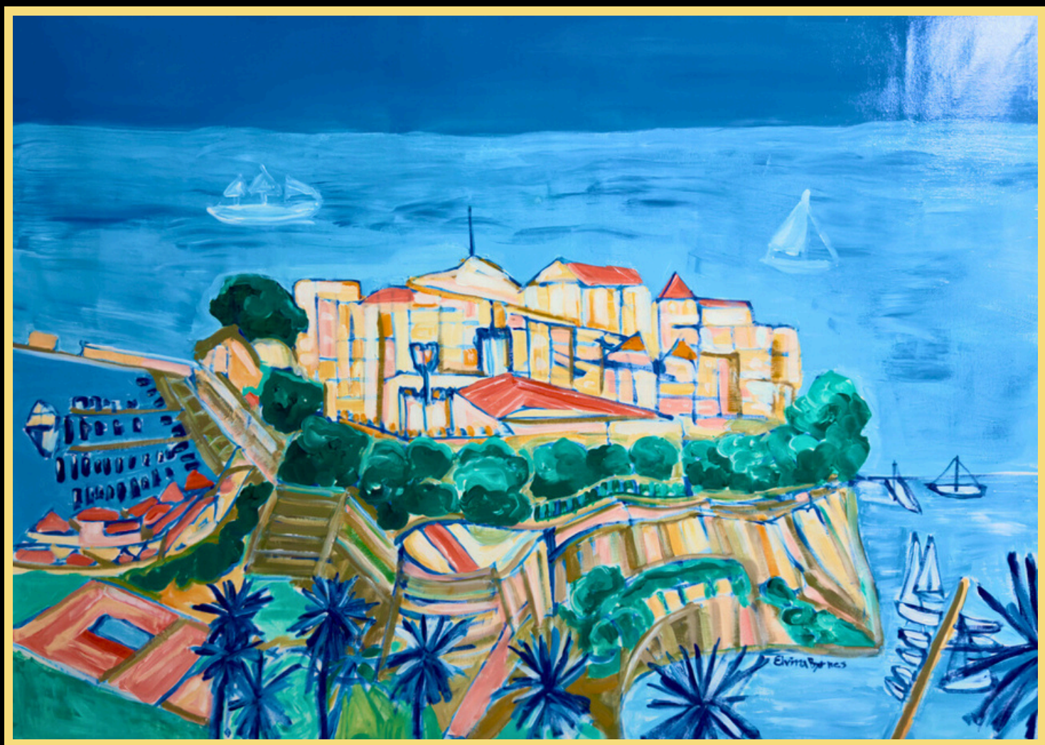
“Le Rocher”, 127x90cm, acrylic on linen