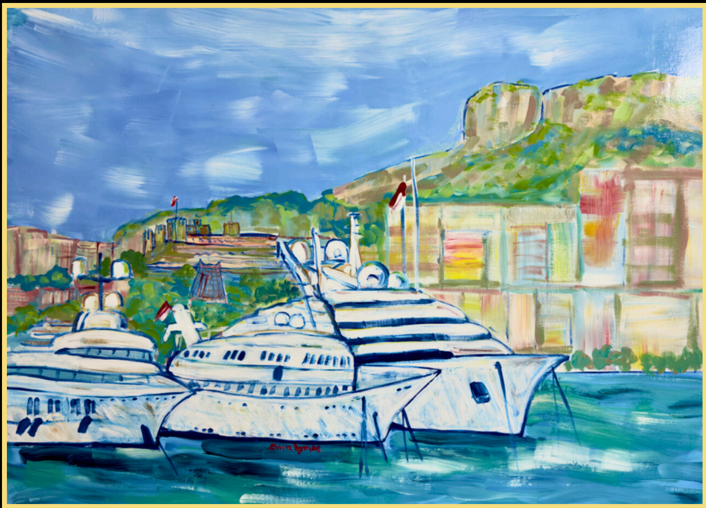
“Opulence & Glamour Monte-Carlo”, 127x90cm, acrylic on linen