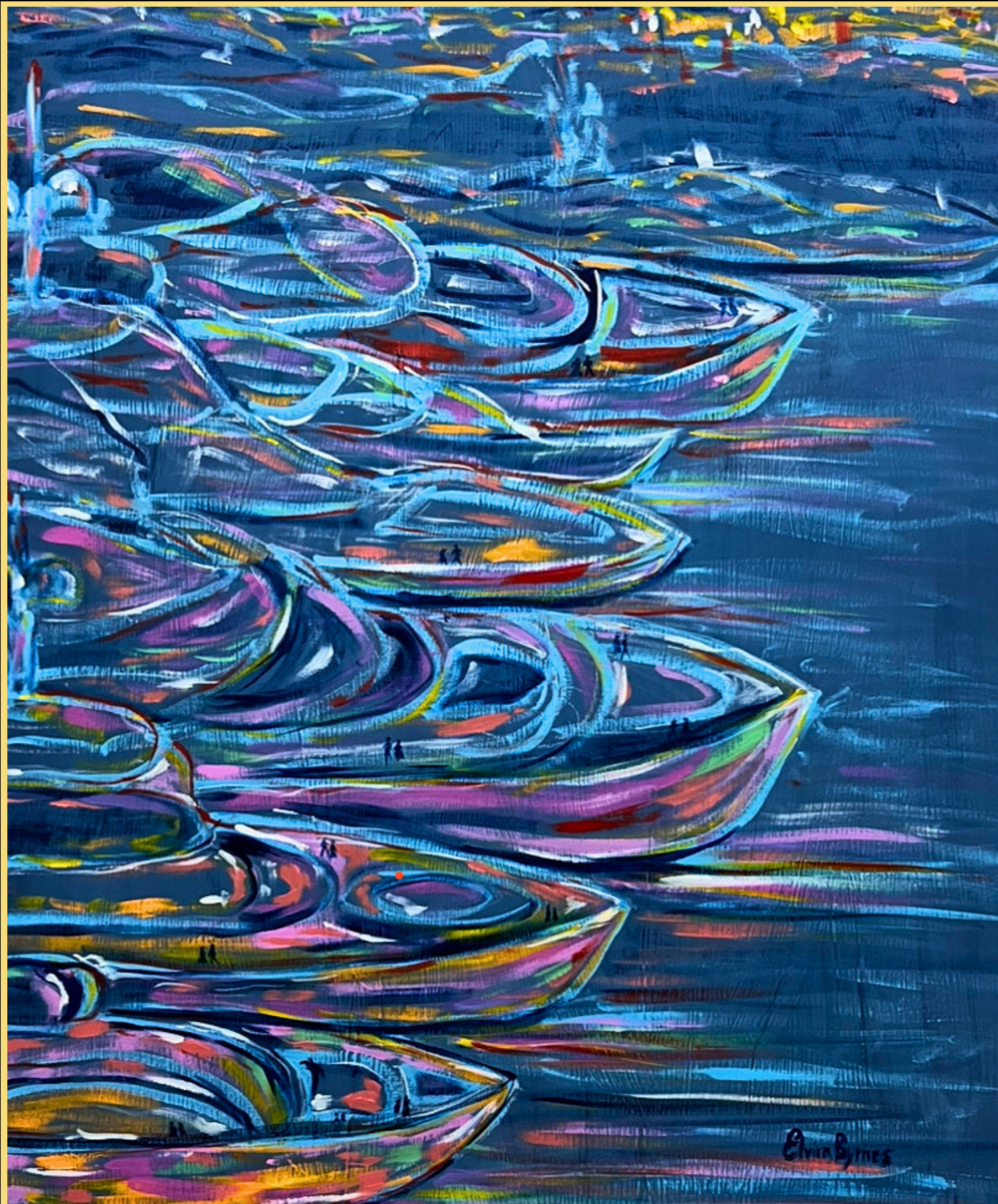
“Boats In Monaco, Party Tonite”, 127x90cm, acrylic on canvas