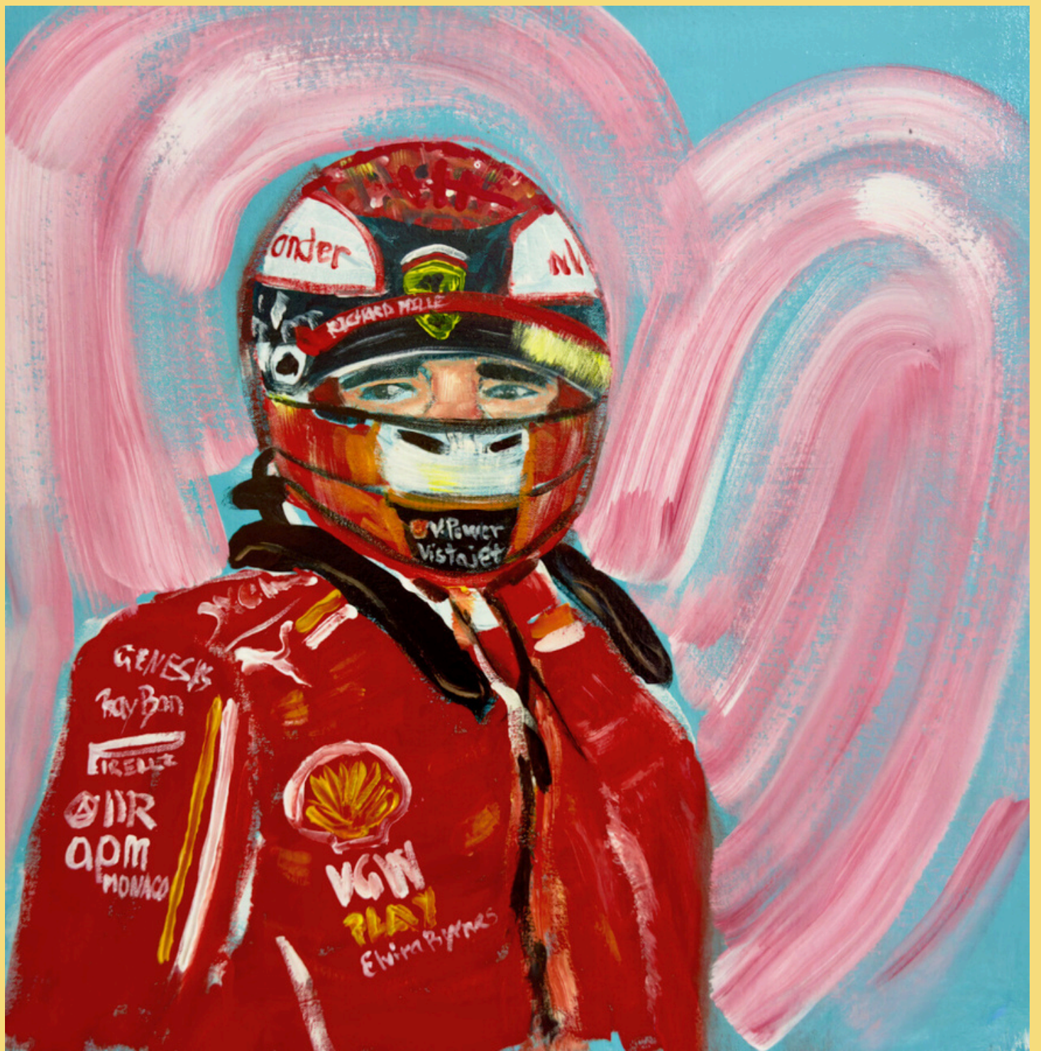
“Charles”, 56x59cm, acrylic on canvas