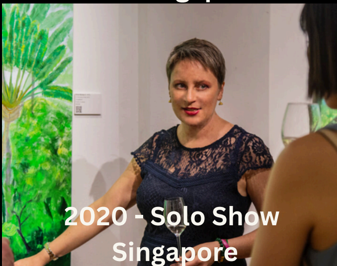
2020 - Solo Show Singapore