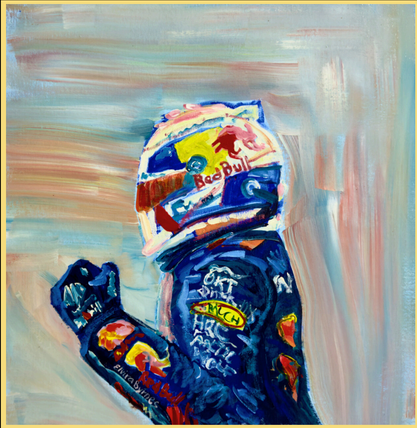
“Max”, 56x59cm, acrylic on canvas