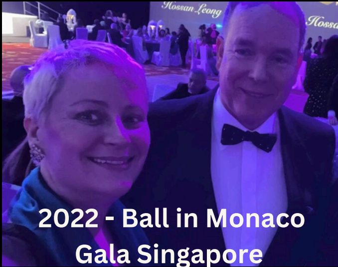
2022 - Ball in Monaco Gala Singapore