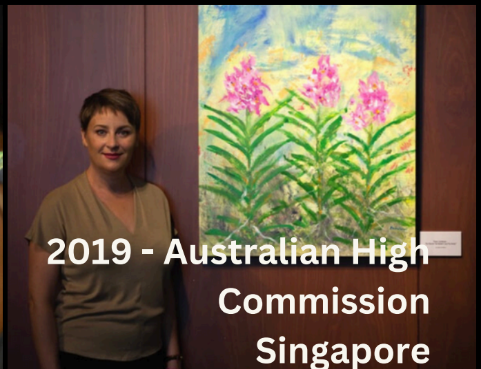
2019 - Australian High Commission Singapore

70 Moments That Stopped My Mind: Haiku Poetry