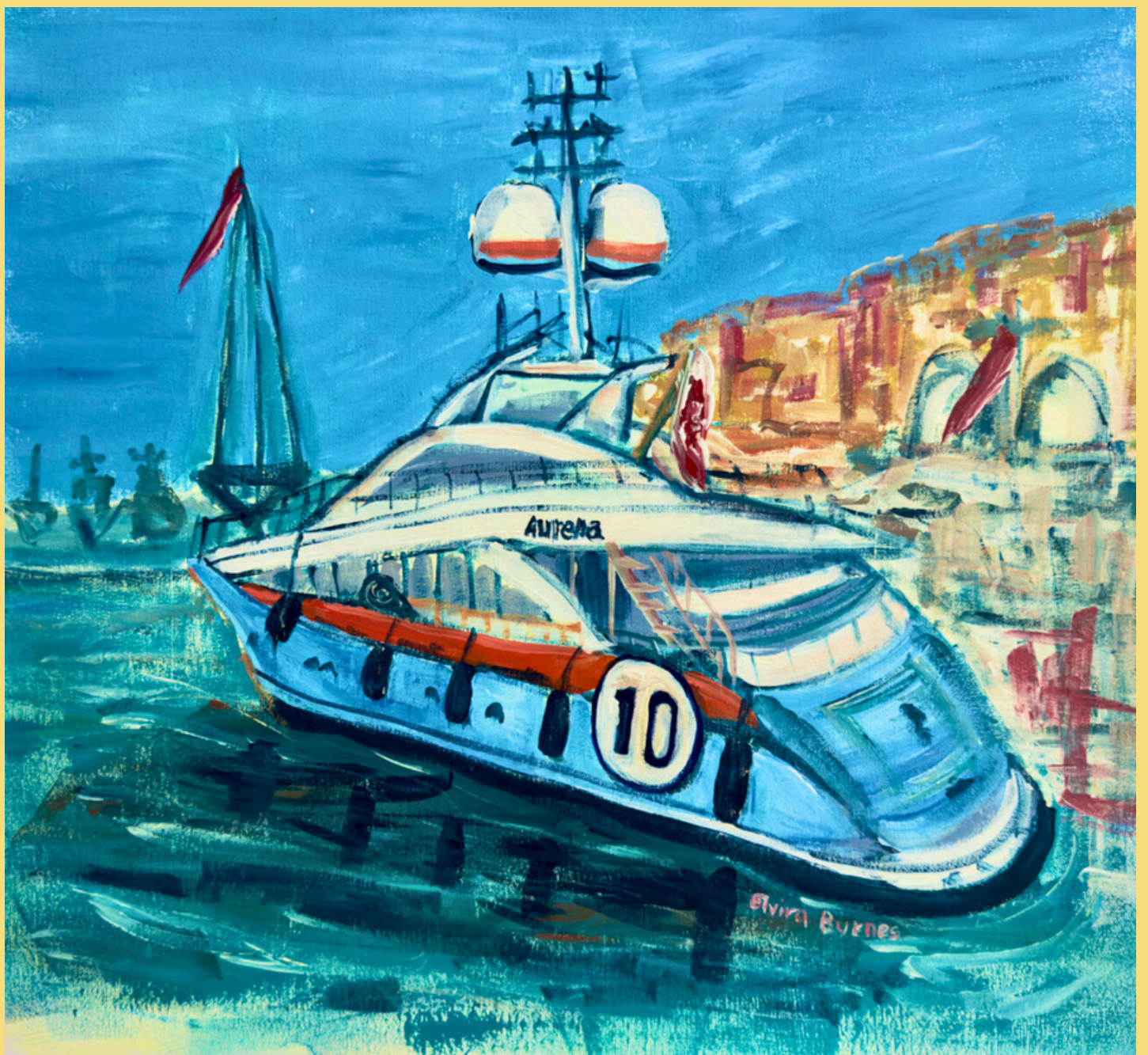
“Aurelia”, 56x59cm, acrylic on canvas