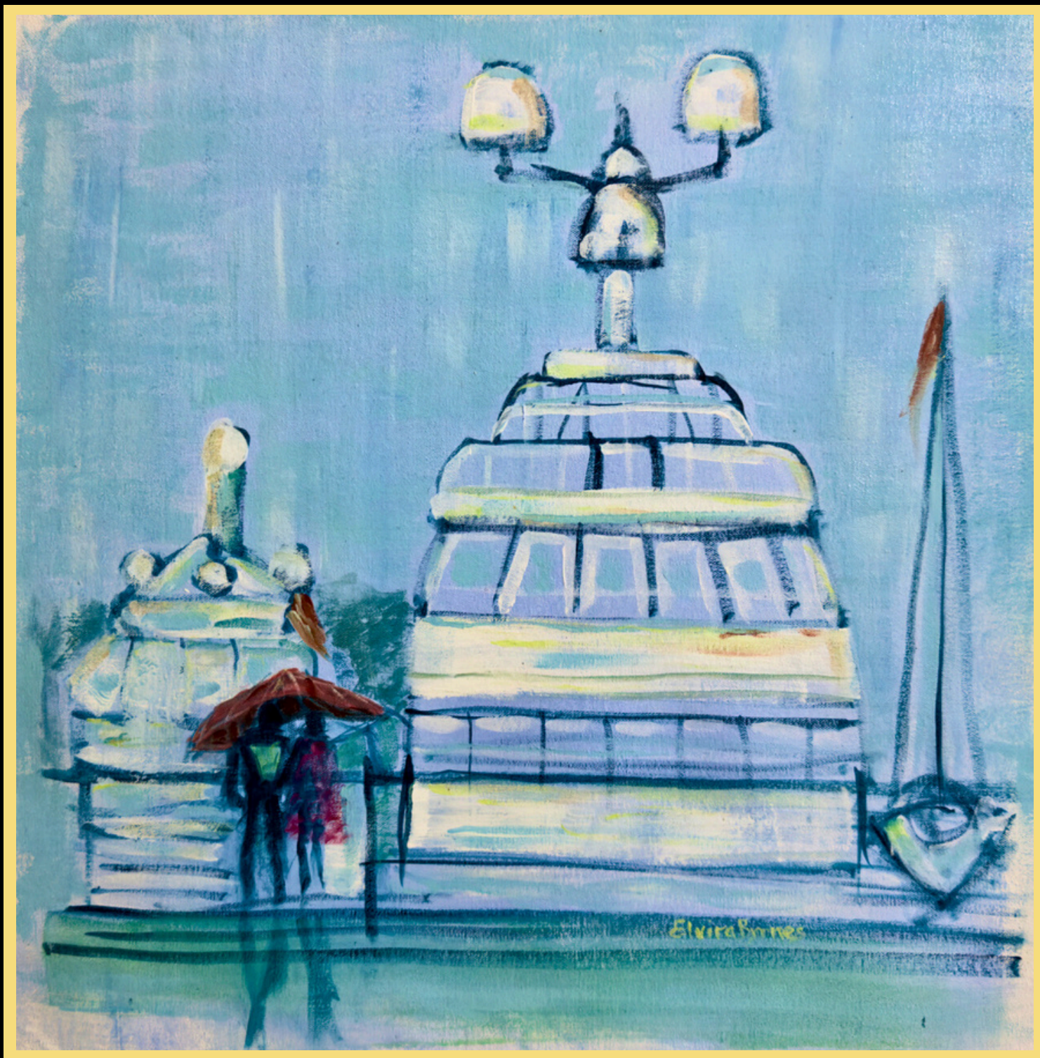
“Rain at Quai Albert 1er”, 56x59cm, acrylic on canvas