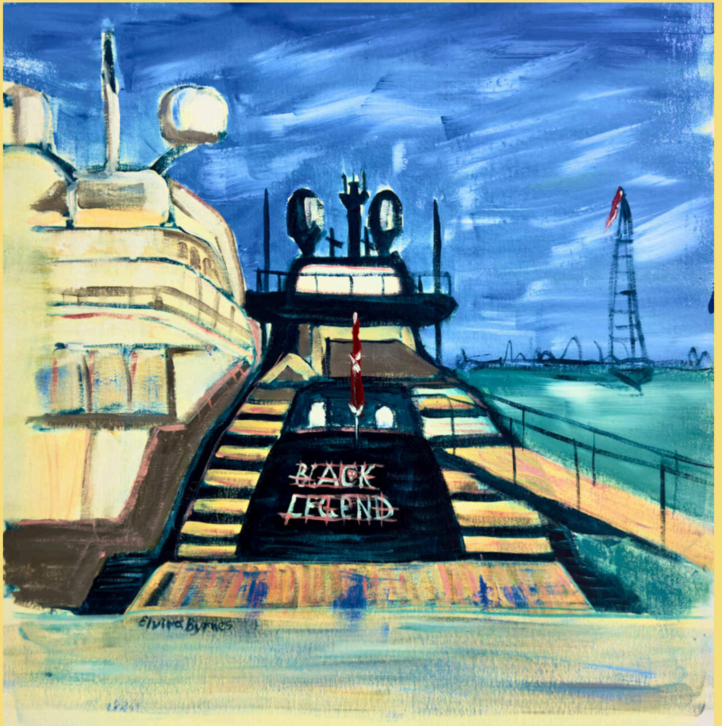
“Black Legend”, 56x59cm, acrylic on canvas