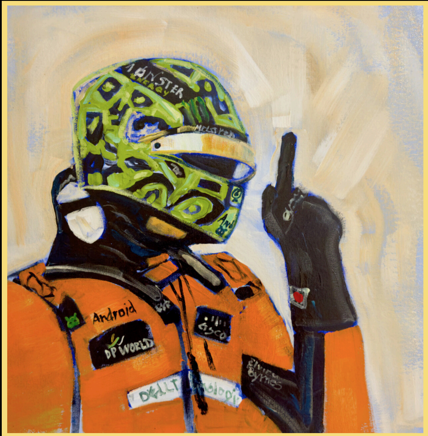
“Lando”, 56x59cm, acrylic on canvas