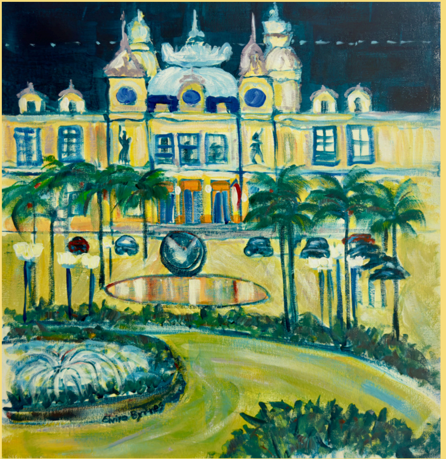
“Night Promenade - Casino Monte Carlo”, 56x59cm, acrylic on canvas