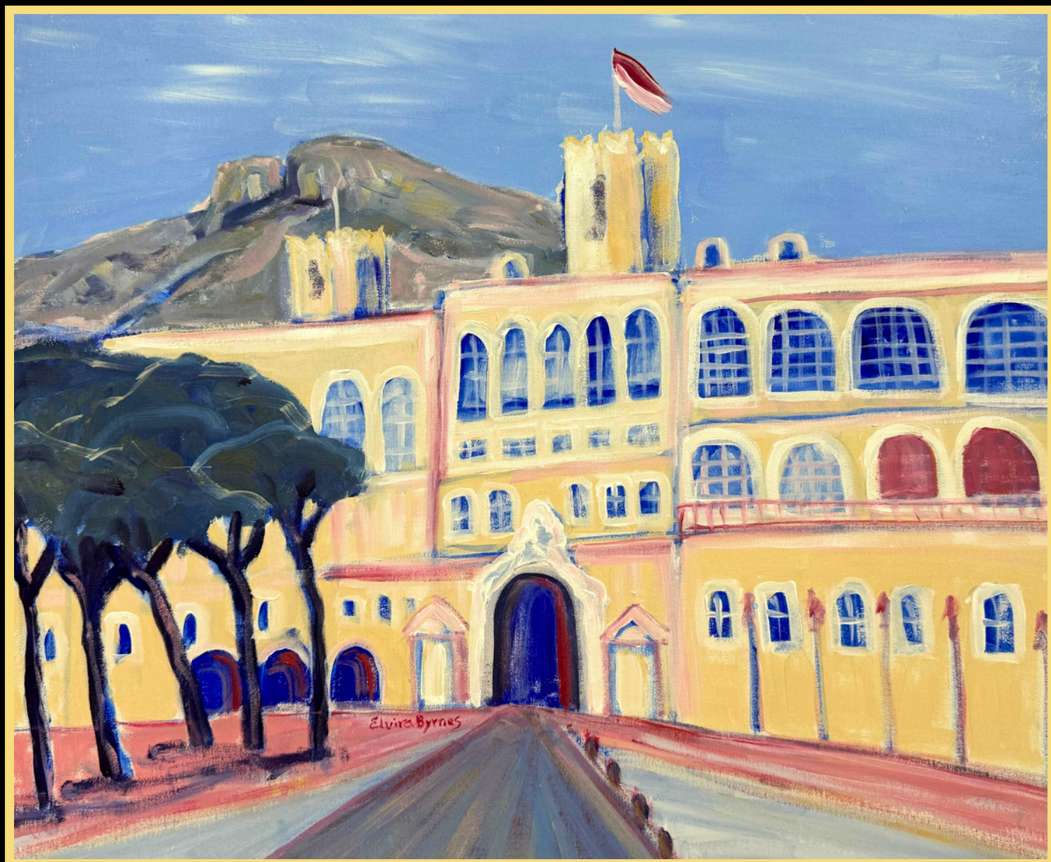
“Le Rocher A La Yives Klein”, 70x66cm, acrylic on linen