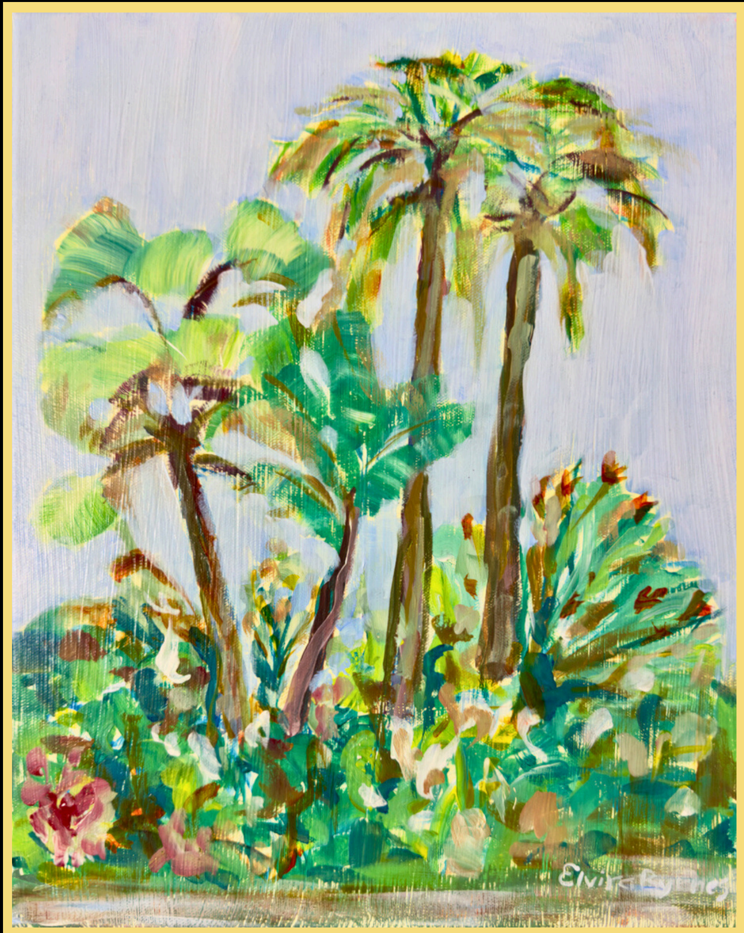
“Jardins de la Petite Afrique”, 41x43cm, acrylic on canvas