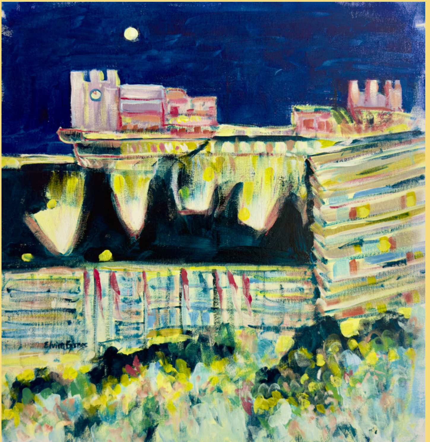
“Moon Over The Rock, 56x59cm, acrylic on canvas