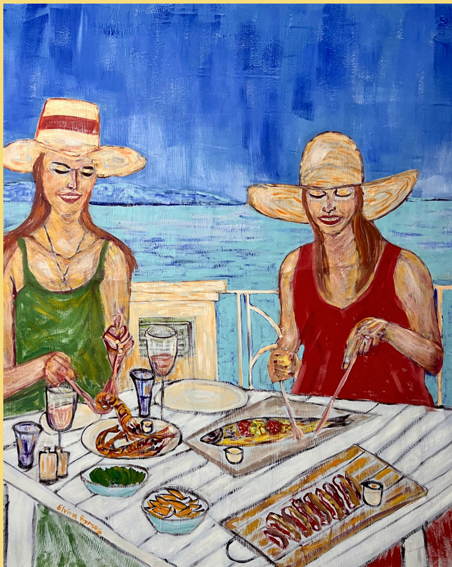
“Luncheon By the Sea, Monaco Bliss”, 127x90cm, acrylic on canvas