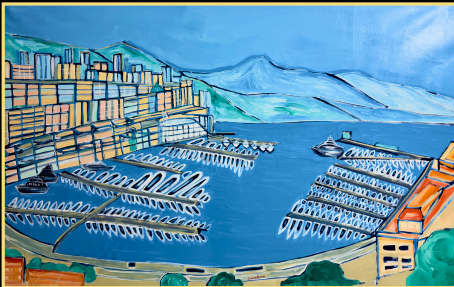
“Monaco Bay”, 190x127cm, acrylic on linen