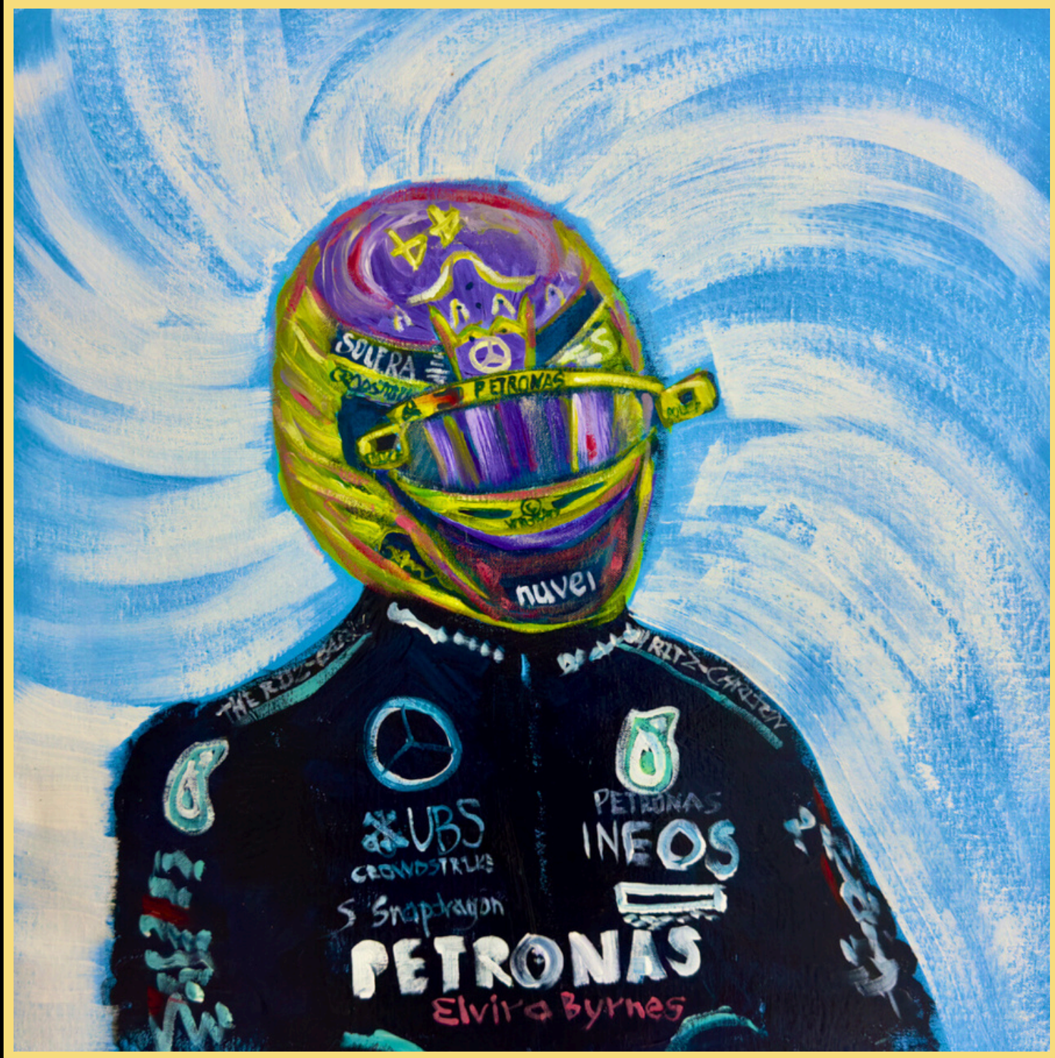
“Lewis”, 56x59cm, acrylic on canvas