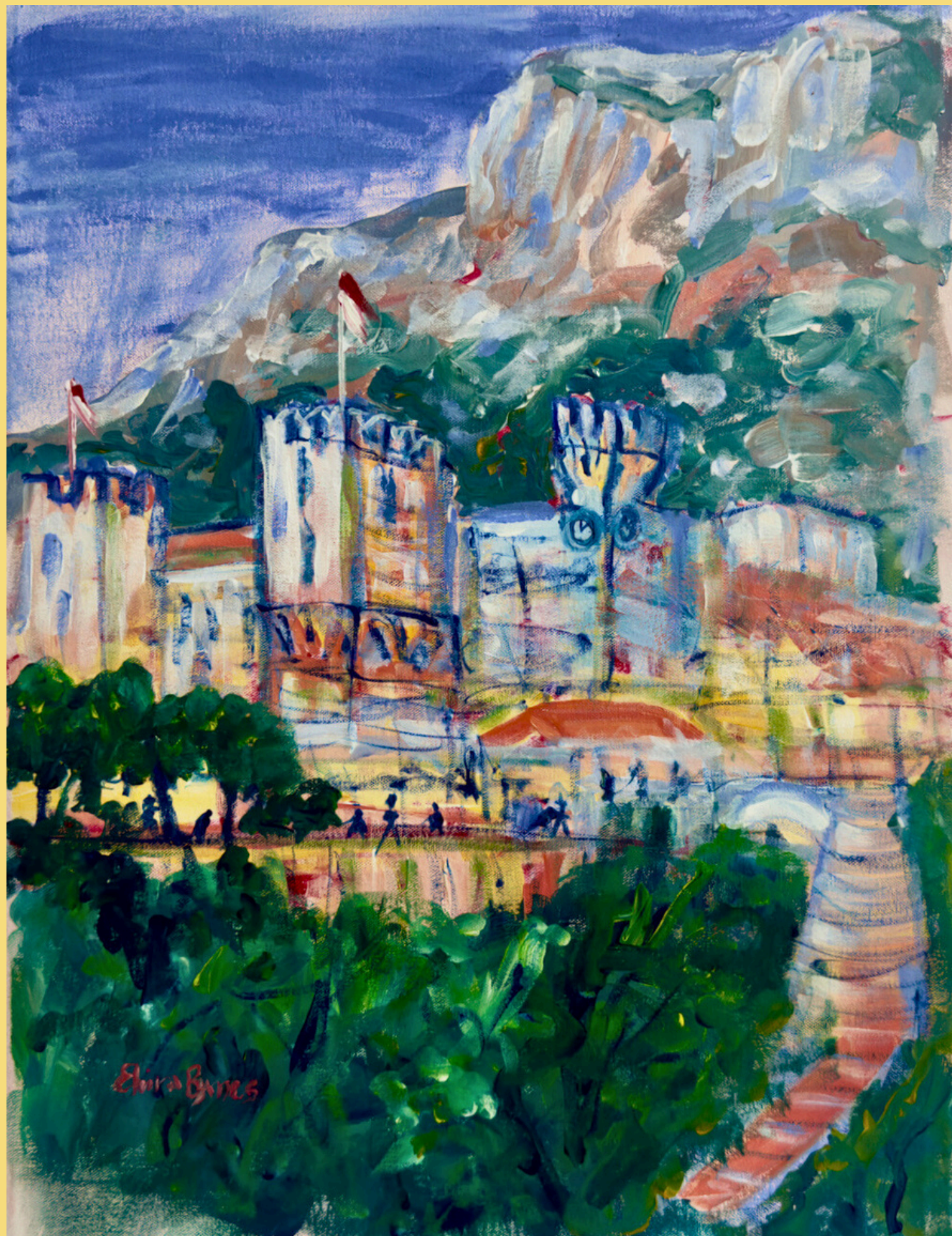
“Palais Princier de Monaco”, 56x59cm, acrylic on canvas