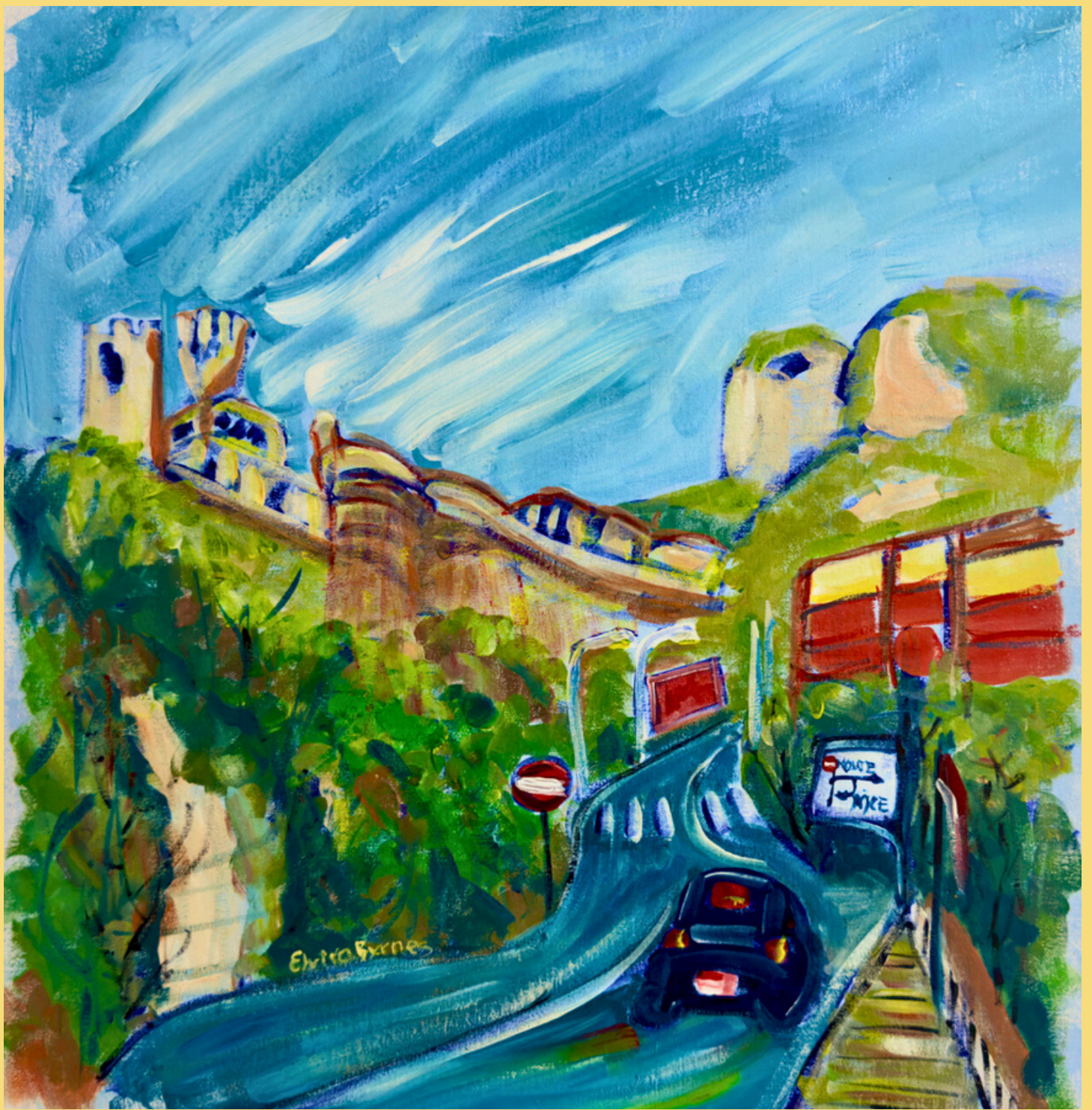
“Zoom Zoom”, 56x59cm, acrylic on canvas