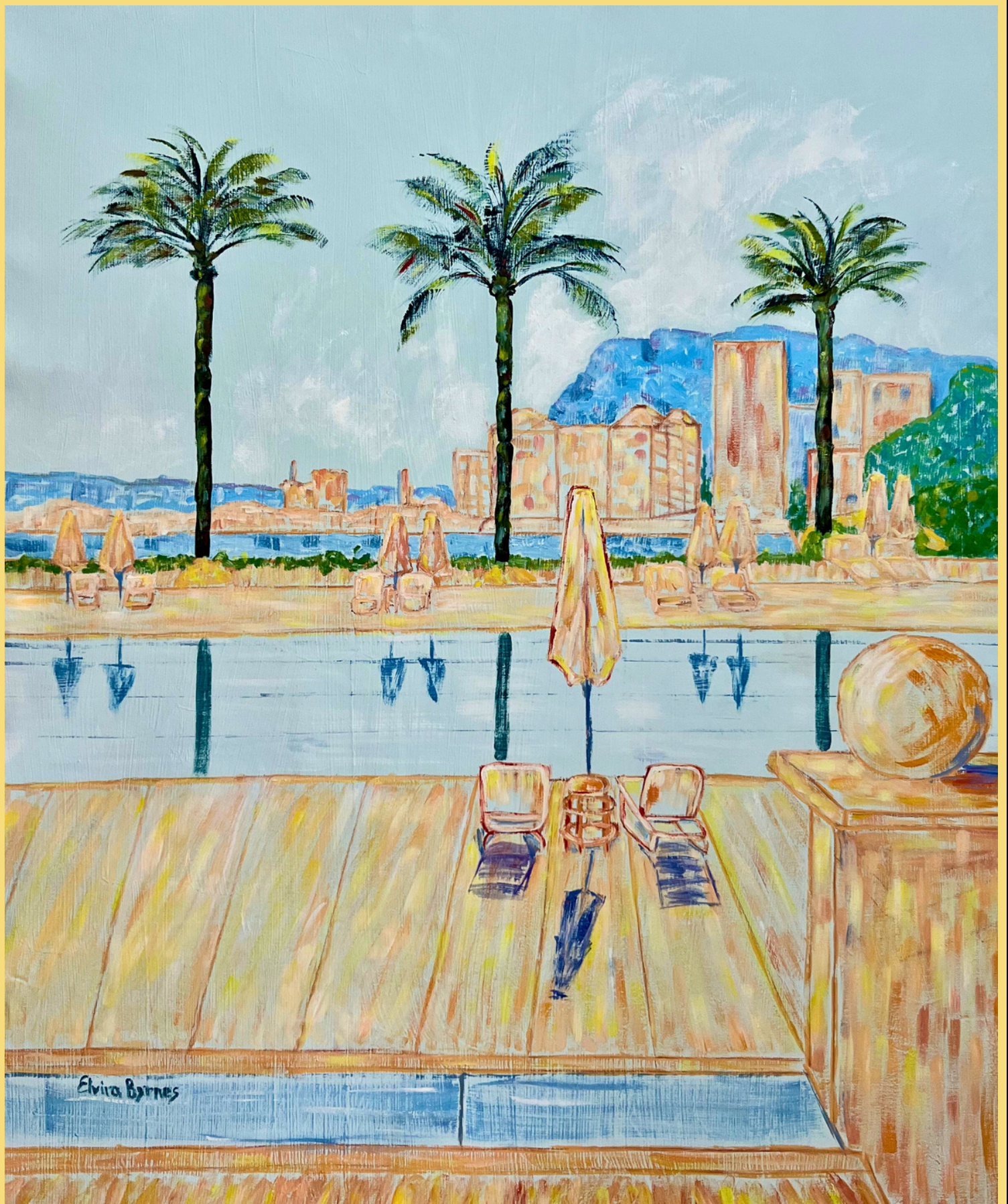
“Morning Swim? All Yours”, 127x90cm, acrylic on canvas