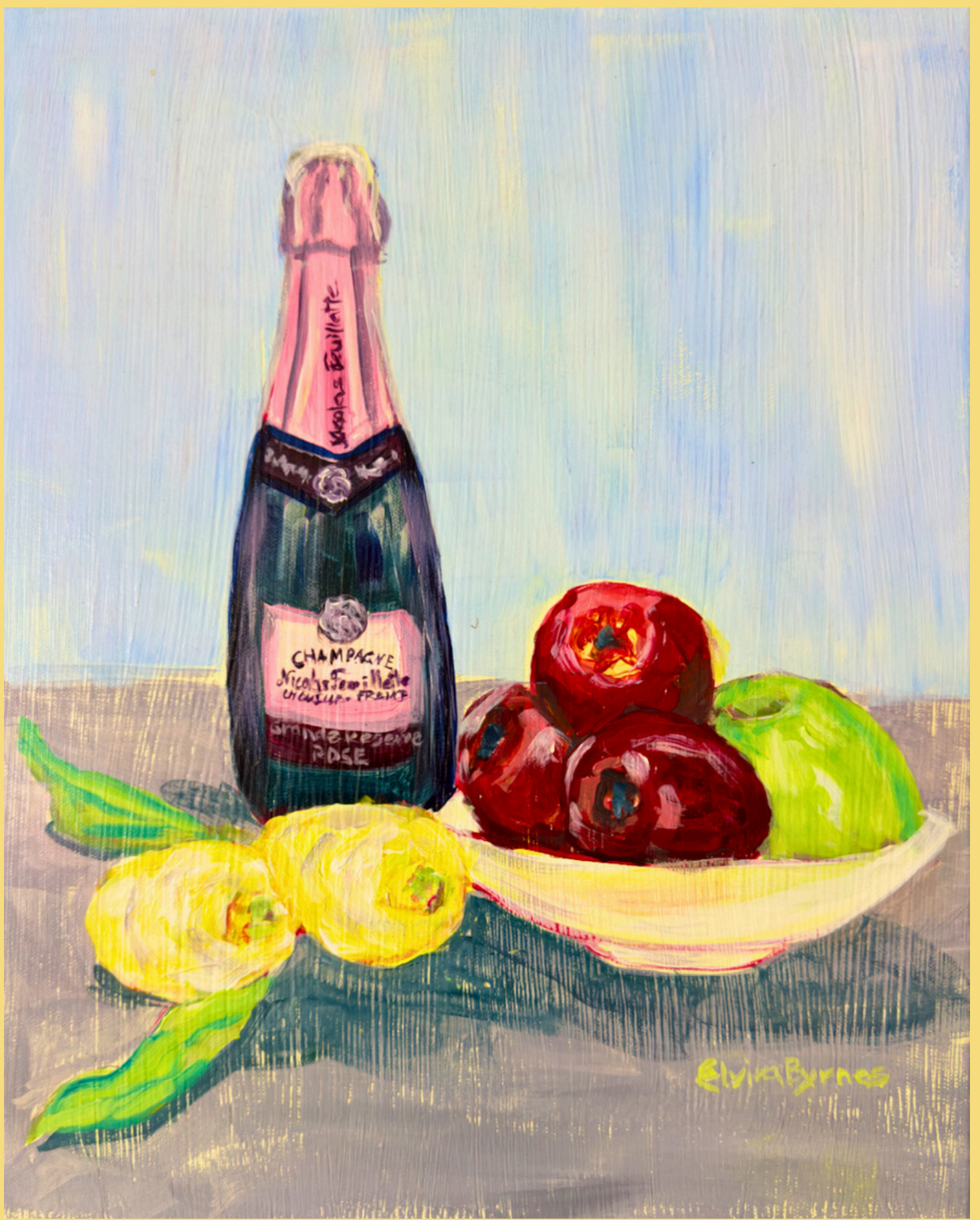
“Cezannesque”, 41x43cm, acrylic on canvas