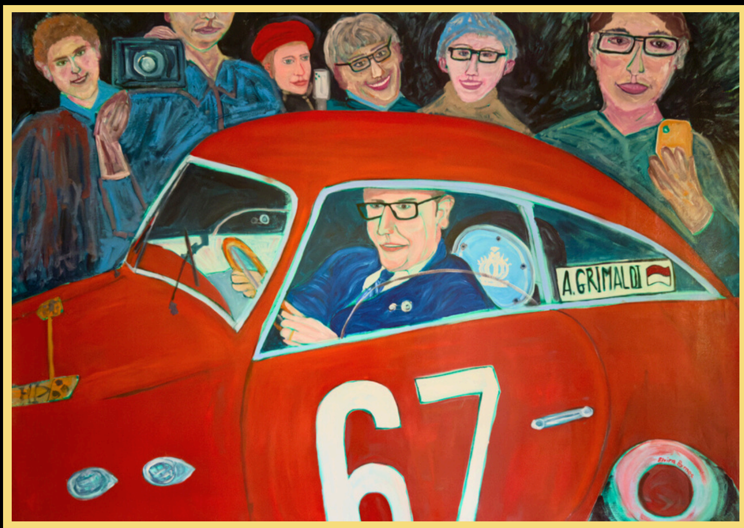
“26th Monte-Carlo Historic Rally”, 127x90cm, acrylic on canvas