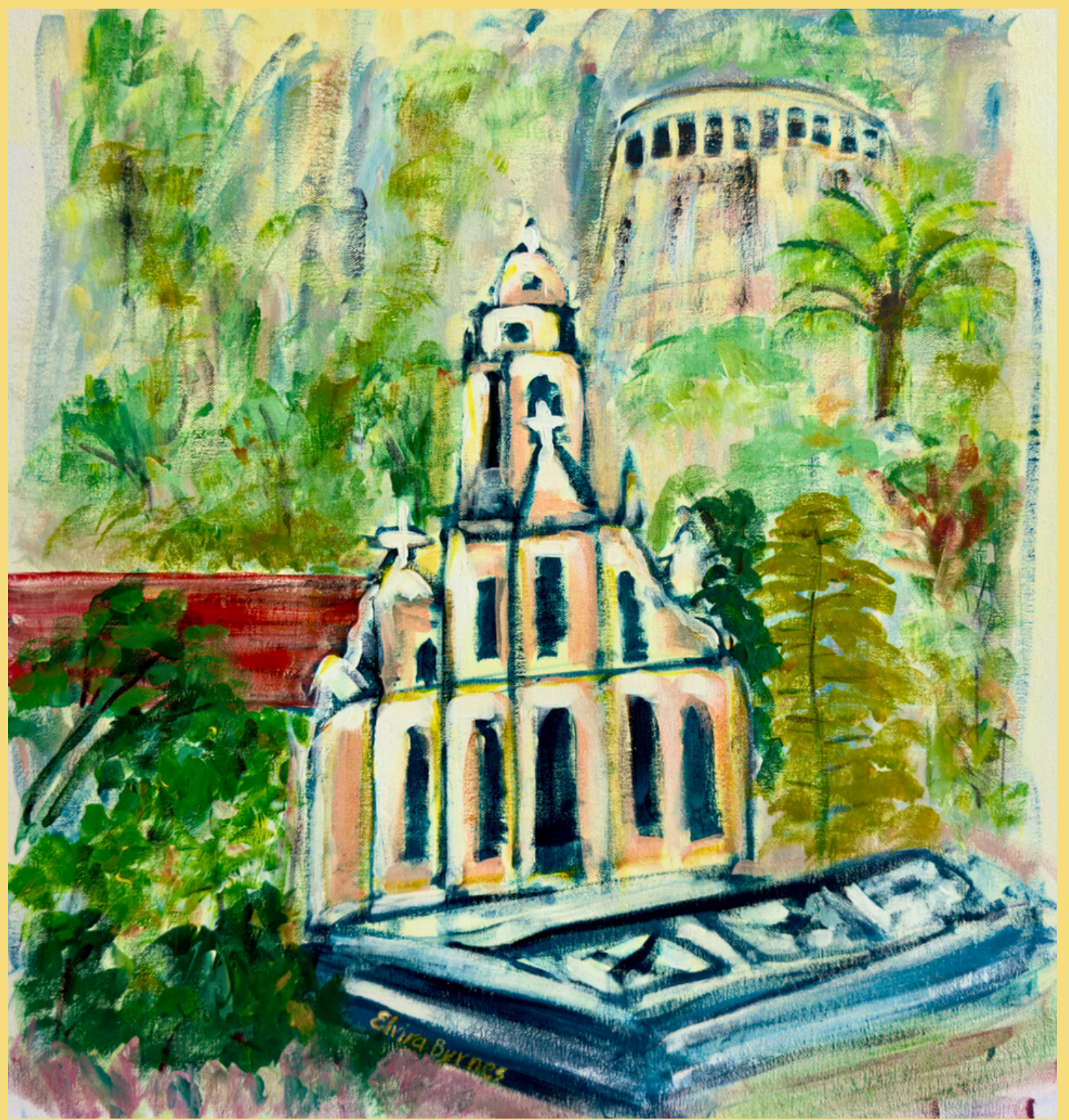
“Église de Sainte-Dévote”, 56x59cm, acrylic on canvas