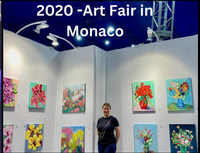
2020 - Art Fair in Monaco